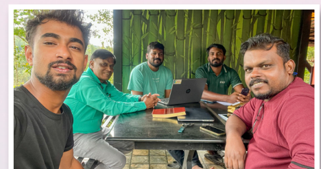
EFICOR Team with Volunteers