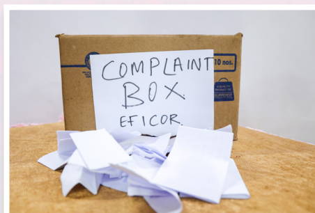
CHS Standards during distribution

The relief team has collected the details of 601 affected families using Kobo collect tool and transferred of Rs. 5,000/- to 103 families and the rest are under process.