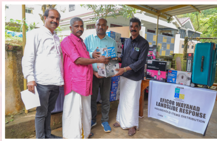
Back to Home Kits Distribution

The relief team distributed back to home kits worth Rs. 8,350 each to 35 affected families. Each Kit consisted of a Mixer/Grinder, a Pressure Cooker, an Iron box, a Flask, an Idly Vessel and a Trolley bag. These kits were supported by 4 Friends from Visakhapatnam.