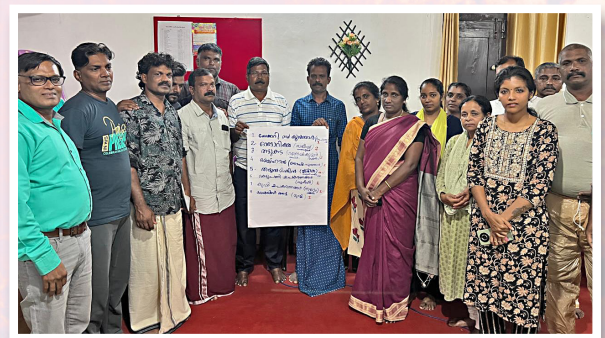
Relief team facilitating the Livelihood Feasibility Test among the beneficiaries

This report will be shared with the Panchayat and report them what EFICOR is planning to do for those beneficiaries selected which will help avoid duplicity from other service providers. EFICOR kept INR 30,000/- tentatively for each beneficiary and whatever would be the actual amount to provide materials would be spent for each beneficiary with an approval from the relevant EFICOR leadership.