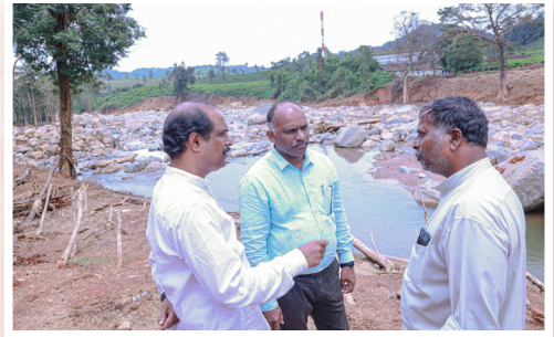
Executive Director visiting the landslide affected areas in Chooralmala town

The EFICOR team in Chooralmala (Wayanad District) has been able to reach the affected communities and started the emergency relief aid. As on date, EFICOR has provided relief materials through the District Administration, which include 35 Back to Home Kits to the selected households and Unconditional Cash Transfer to 103 families out of 1000. The team is constantly in touch with the communities, Panchayats, District Administration and other stakeholders to maximize our response. EFICOR's Senior leadership team has also visited the devastated villages and met with the affected families, the government authorities involved in relief distribution.