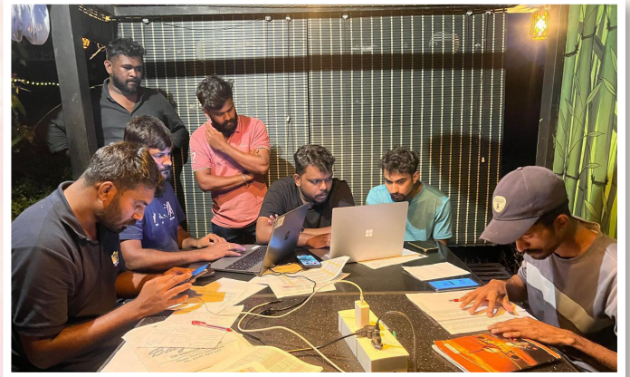
Relief team verifying KOBO details for cash transfers