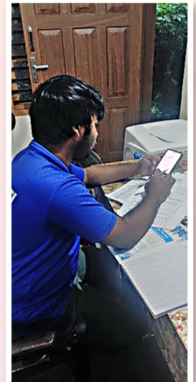
Figure 1. Kobo Survey by volunteers

EFICOR has already surveyed 310 families through using Kobo tool and are continuing survey remaining families for unconditional cash transfer support. So far, EFICOR has provided unconditional cash transfer of Rs. 5,000/- to 103 Families. EFICOR has also identified 30 Families for providing additional requirements in the back-to-home kits such as Pressure cookers, Induction Stoves, mixer/grinders, idly vessels, and other related utensils.