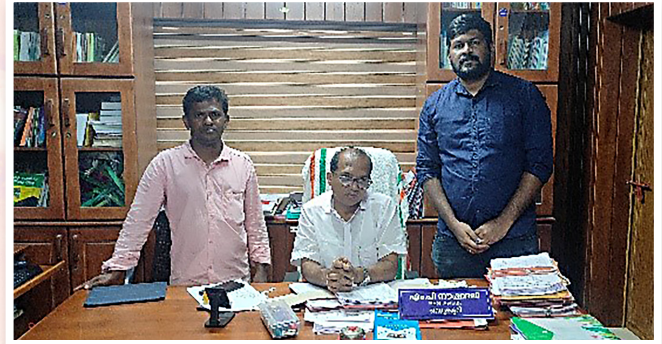
Figure 2. EFICOR with Meppadi Panchayat Secretary