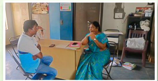
Meeting with School principal

EFICOR has conducted an assessment and identified 1,200 families in the NTR District, specifically in the areas of Ibrahimpatnam and Vijayawada, who have been severely affected. These families were in urgent need of relief assistance. This includes the distribution of both food and non-food items to meet their immediate needs, as well as cash transfers to help them recover and rebuild their lives in the aftermath of the disaster